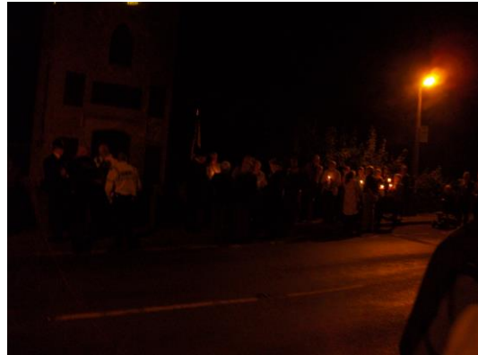
Remembrance by Candlelight

(the time that war was declared 100 years ago).