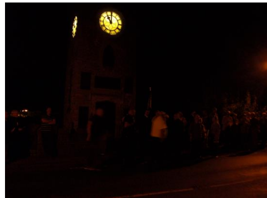
Clock strikes 11pm