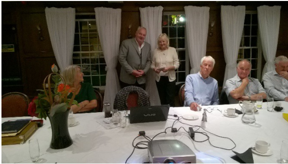
Charitable Presentation to Snowdrop