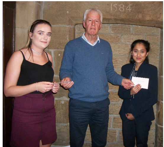
Scholarship Presentation 2017