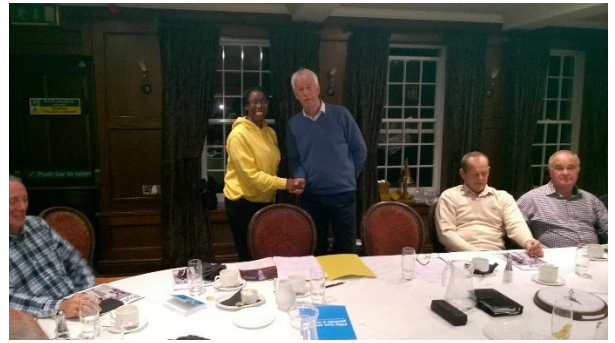
Charitable Presentation to Sheffield Children's Hospital