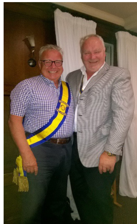
Sgt at Arms in New regalia