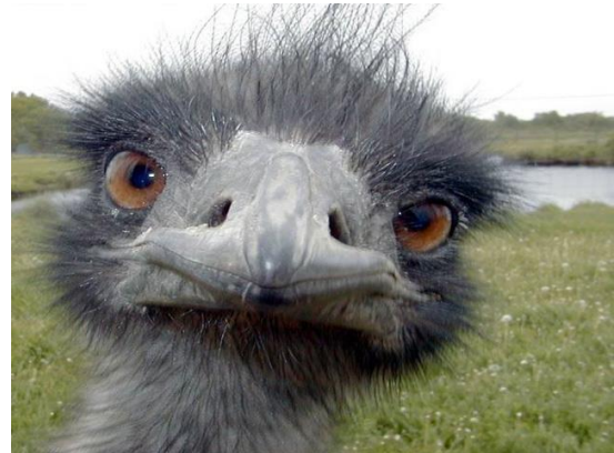
Inexplicable Newspaper Headlines / Stories (Couldn't make it up could you?)

The man sighs, pauses and answers, "My second wish was for a tall chick with a big ass and long legs who agrees with everything I say.."