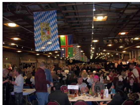
Oktoberfest in full swing