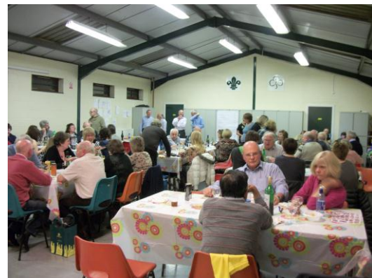
Wine & Wisdom Evening