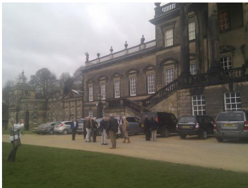
Waiting for the tour

A number of Rotarians, Family and Friends (50 people) visited Wentworth Woodhouse and were shown round the Public Areas of the house. A very interesting tour. For more information about the house, click on the link below:- http://www.wentworthwoodhouse.co.uk/