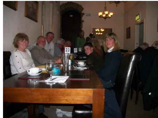
Meal at George & Dragon