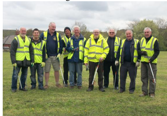
Group Photo before Refreshments