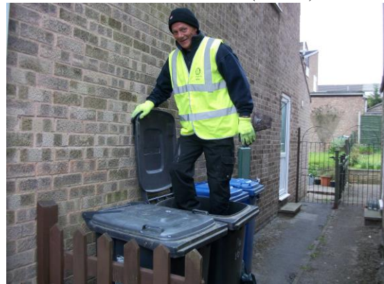
Filing the Rubbish!