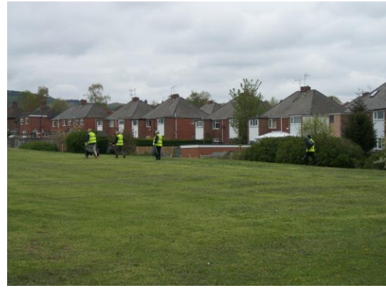
Rotarians in action (above)