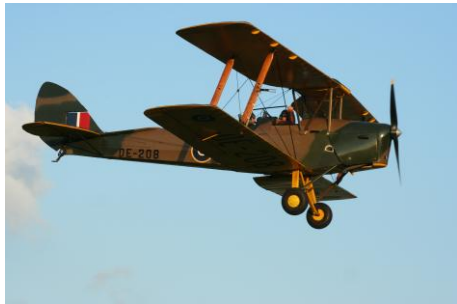
Those Magnificent Men in Their Flying machines

good thing to accept this, and the opinion of the meeting was that we should accept it (ensuring that any publicity mentions that insurance is the responsibility of the winner).