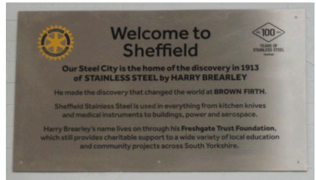
Plaque on Sheffield Station concourse

The second plaque was unveiled by the Master Cutler at 2:30pm, at Sheffield Railway Station. Some of you may have been there. However, if you were not, here is the plaque, and a picture painted on the wall of the Howard Public House on Howard Street.