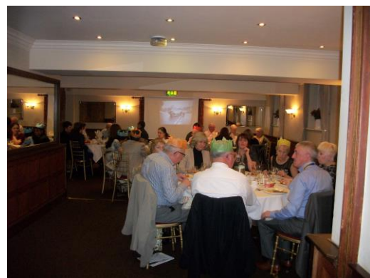
Club Christmas Dinner