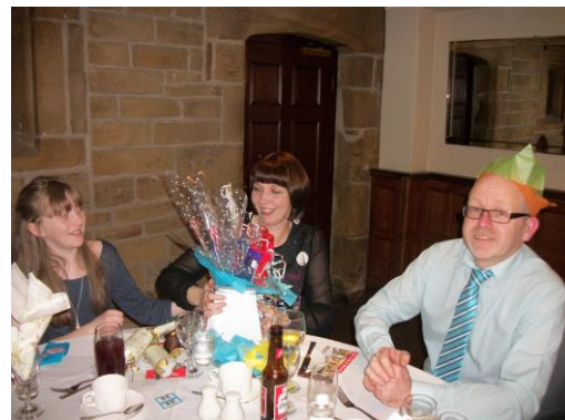
Raffle Winners and their winnings