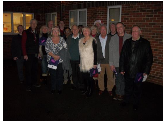
Group 1 after singing at the second home