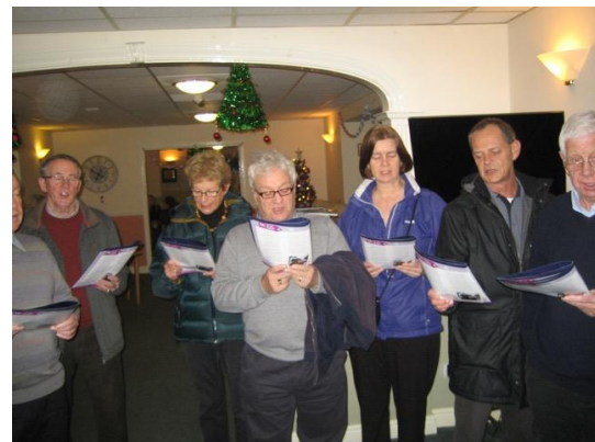
Group 2 in full flow