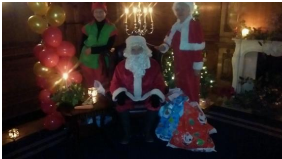
Santa and his helpers – 14 th December

Wortley Santa Sleigh, compete with Santa were at Wortley Hall on 14 th and 21 st December at the request of the Hall, to hand out presents to children at lunchtime. The pictures below shows Santa in his Grotto, with his helpers.