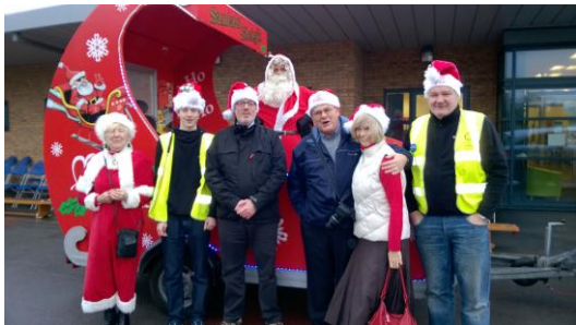
Santa poses with his entourage

Santa visited Woolley Wood School on 18 th December, ably helped out by a number of Club Members & family (see picture below)