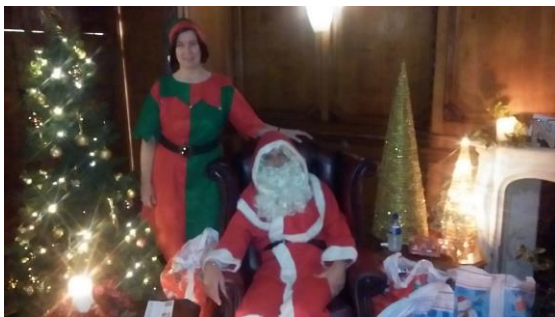
Santa visits again – 21st December