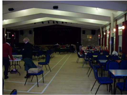
The Venue before the event began

This took place on Saturday 17 th January at Grenoside Community Centre. Those attending braved the snow to get there, and by all accounts, had a good time. The final total raised is not yet known. The pictures below were taken on the night:-