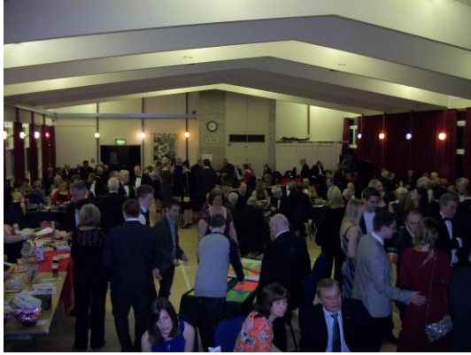
In full flow