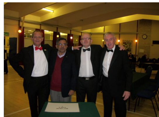
Rotarians preparing for the night's events