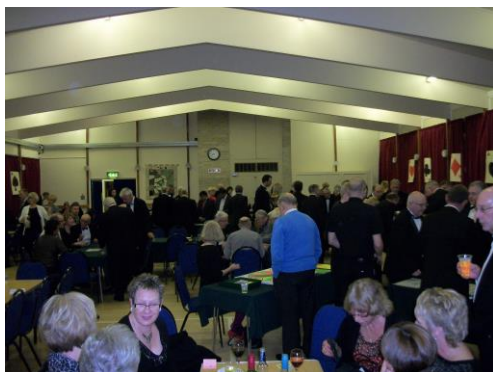
The Games commence