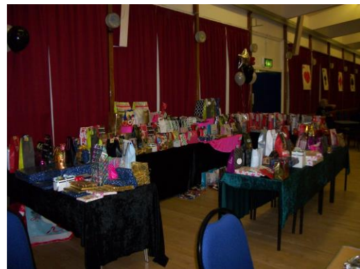
Tombola Prize Table

The first Millionaires Night run by Wortley Rotary Club was held on 18 th January at Grenoside Community Centre. It seemed to go very well from what I saw on the night. Some pictures from the event are included below – if you want more, have a look on the Website.