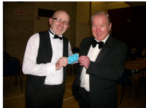
Mr President hands over some cash!