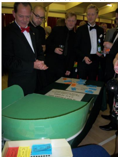
Games in progress