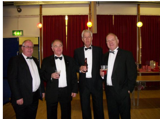
A fine body of Rotarians

A number of Rotarians and Guests attended the Millionaires Night at Grenoside Community Centre on 19 th January. This event has been offered to the club as a fundraising event, so some members got involved in running some of the games with that in mind. No doubt the evening and the proposed future will be discussed at the next Club Meeting. The pictures below give a flavour of the evening.