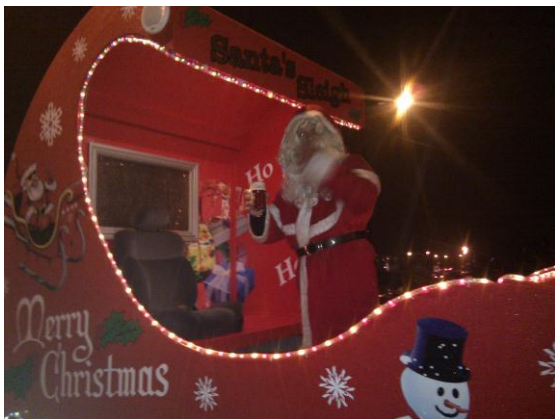
Santa has a drink on Christmas Eve