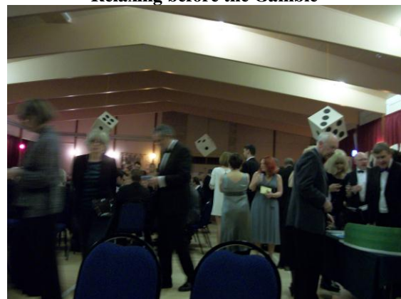
The hall during the evening