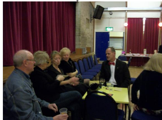
Relaxing before the Gamble