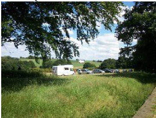
The arrow is pointing to ...