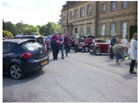
Main Exhibit area