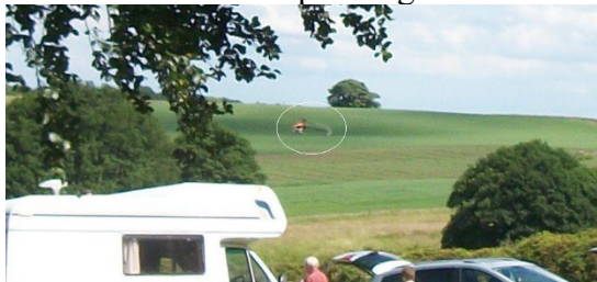
This model helicopter