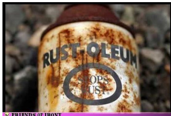
FRIENDS OF IRONY