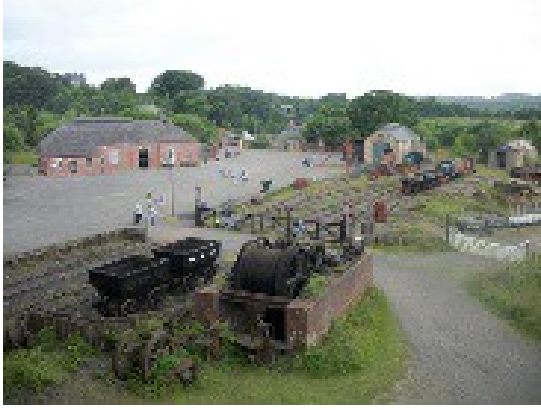
Looking back toward Pit Village from Pit