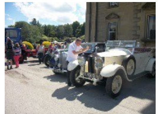
Stalls / exhibits in the top area