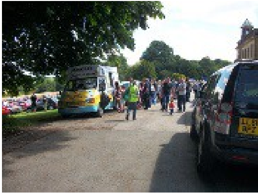
Queue for the Ice-creams