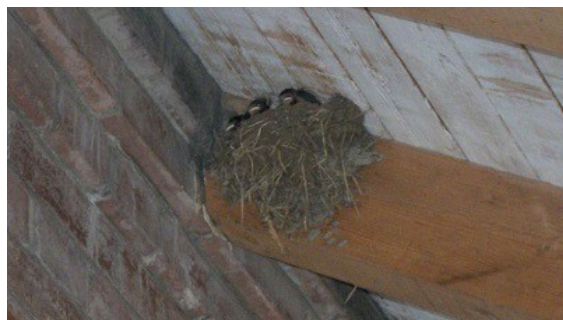
Baby Swallows near Pit

The results of the judging in the various vehicle categories were as follows:-