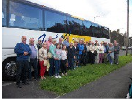
Rotarians & Family / Guests