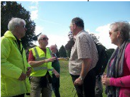
Rotarians meet 'Old' friends