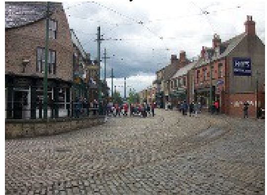
Main Street in Town