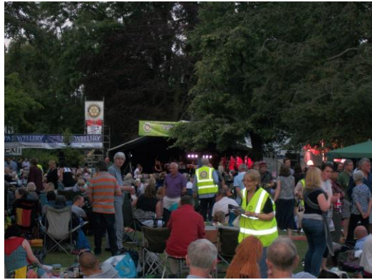
Thursday – Glenn Miller restart after the break