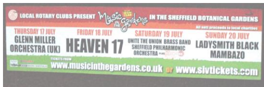
Who was on

Click the following link to look at their website and learn more:- http://woodheadmrt.org/