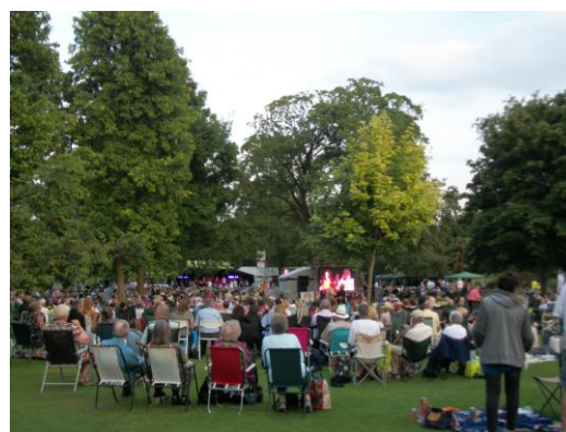
Thursday – Glenn Miller

This was held over 4 nights (17 th -20 th July, and was well received. I went to the first night and it seemed to go down well. The weather was good, and what I heard of the music , it was good as well. I trust that those who attended the other 3 nights enjoyed it as well. Ed.