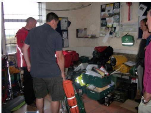
The Kit Room

In commemoration, The Royal British Legion are inviting you, wherever you are at the time, to take part in LIGHTS OUT, a UK-wide event that asks everyone to turn