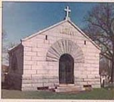
The Lane County mausoleum, which was demolished, is shown in a photograph.

When a mausoleum is demolished, it is a grim task for the workers who demolish it. In the case of the Lane County mausoleum, it was a grim task for the workers who demolished it.