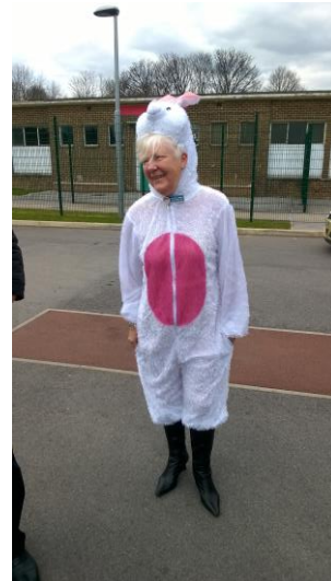
A rare sighting

Wortley Rotary took a little bit of Easter to Woolley Wood School on 27th March. The pictures below include the very rare Wortley WoolleyWood Wild Willey Wabbit (!)