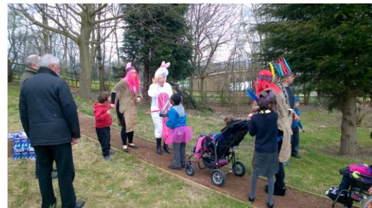
The children meet the 'Wabbit'