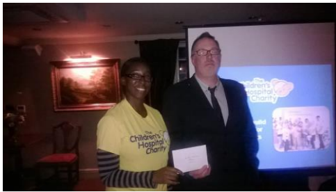
Scrap Collection Initiative Cheque presentation