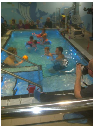
Rygate Centre Opening