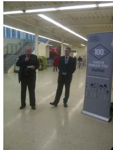
Harry Brearley Plaque unveiling